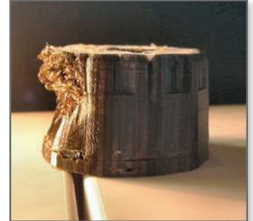
Figure 1: Example of Distorted Part Distorted part due to improper air flow.

When building multiple parts, align them along the “Y” axis. Doing so will prevent blocking of the airflow between the parts. Space parts approximately 1 inch apart (figure 2).