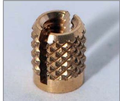
Figure 4: Expansion insert.