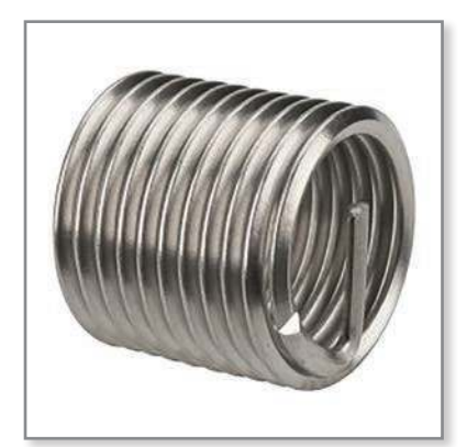
Figure 5: Helical insert.