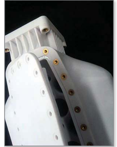
Figure 1: Brass threaded inserts installed in an FDM part.

Processes - Best Practice: Embedding Hardware - Best Practice: Bonding