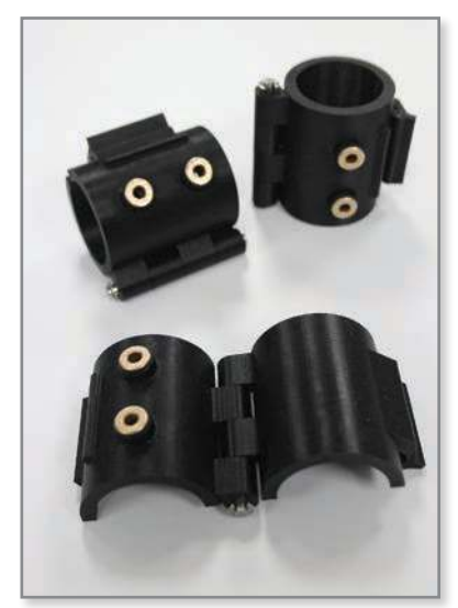
Figure 6: Wear-reduction bushing.