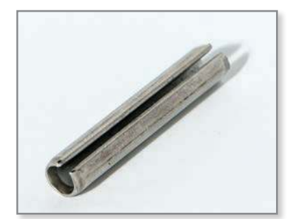
Figure 9: Compression-limiting insert.