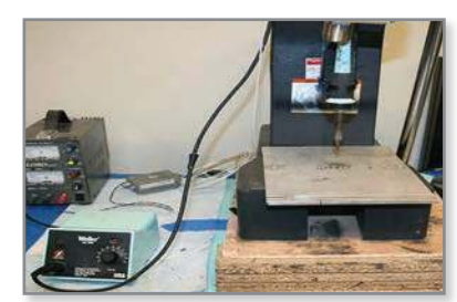
Figure 10: Press fitting arbor press.