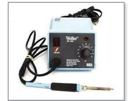
Figure 11: Heat setting soldering iron.