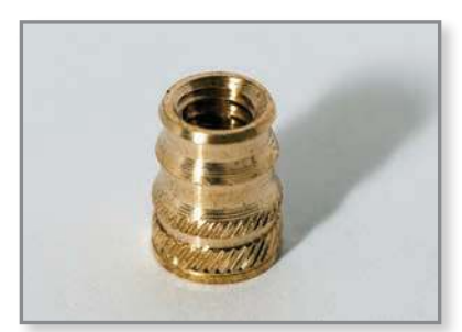
Figure 3: Knurled and barbed heat-set brass threaded insert.