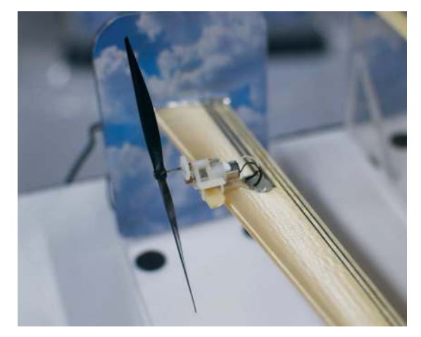
Aurora smart wing: 3D-printed structure with printed electronics.

This manufacturing approach reduces the design constraints engineers face when using traditional fabrication techniques. The design of the wing's structure was optimized to reduce weight while maintaining strength. "The success of this wing has