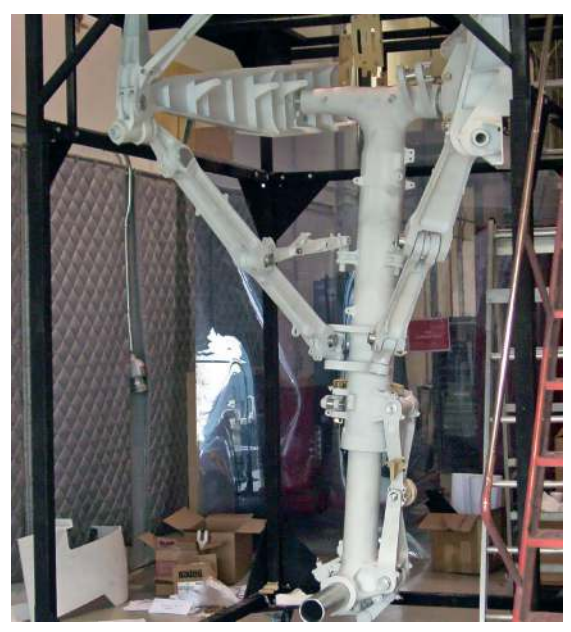
Surrogate landing gear for commercial jet.

The value in surrogates – which are placeholders for the production assemblies — is that they are full-featured low cost replacements for highvalue parts. 3D printed surrogates are used on the production floor and in the training room. For example Bell Helicopter used surrogates to assess the Osprey hybrid aircraft's tailwiring configurations. Bell Xworx used an FDM system to build polycarbonate-wiring conduits. Technicians installed the branching conduit's six mating sections inside the Osprey's twin vertical