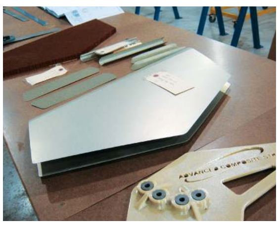
ACS helicopter fin (center) with AM drill guide (front).

The type and scale of 3D printable parts in additive manufacture is increasing as the size of print-bays and the range of 3D printable material types increases. For aerospace, the availability of lightweight, flame and chemical resistant 3D printing material is key to broader application.