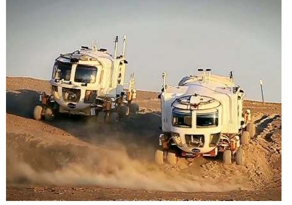
NASA outfitted the Mars rovers with 70 AM parts.

Production parts for instrumentation (Kelly Manufacturing), air ducts (Taylor Deal) and wingspans (Aurora) are airborne today in commercial, military aircraft and UAV's.