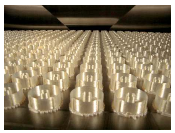
500 toroid housings are produced overnight with an FDM-based Fortus machine.

Taylor's 3D printing material of choice is ULTEM<sup>®</sup> 9085, which meets FAA flame regulations. Having a flight-grade material "gives designers much more flexibility when designing parts. It allows us to reduce engineering time and manufacture a less expensive part."