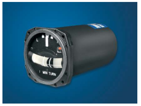
This instrument contains a toroid housing, produced via additive manufacturing.

In addition to prototypes and tooling, modern 3D printing technology can produce durable, stable end-use parts — bypassing the production line altogether. The Production Series from Stratasys uses a range of materials, including highperformance thermoplastics, to create parts with predictable mechanical, chemical, and thermal properties.