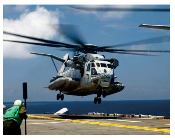
This CH-53E Super Stallion is a good candidate for surrogate parts.

parts will be made practical by additive manufacturing.