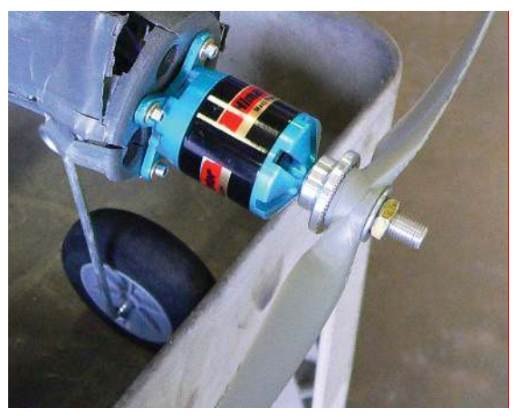
For SelectTech, UAS test flight damage is a learning experience.

Low aerospace volumes make additive manufacturing an attractive, lower cost alternative to replace conventional CNC machining and other tooling processes for smaller scale parts and finished assemblies.