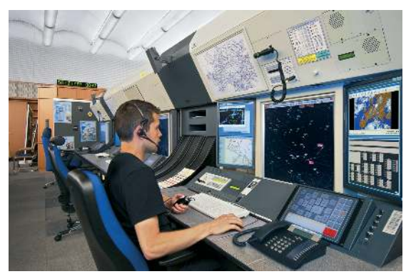
Ground support systems use AM.

When the design was ready to take off, Leptron had flight-ready parts in less than 48 hours, all thanks to additive manufacturing. And for this project, there were multiple designs for specific applications, such as eight variations for the nesting integrated fuselage components. If it had used injection molding, as it had in the past, tooling expense would have exceeded $250,000 and production parts would have arrived six months later.