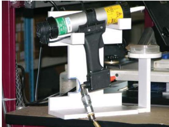
When machined fixtures were quoted at $12,000 and seven days, Thermal Dynamics opted to make them with FDM to save $10,000 and several days.

sophisticated robotic end-effectors (grippers) and rudimentary trays, bins and sorters for conveyance and transportation. No matter the name, description or application, manufacturing aids increase profit and efficiency while maintaining quality.