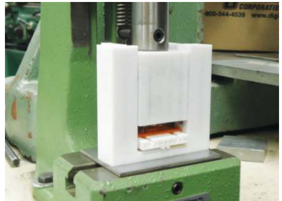
An operator at Xerox modified 350 connectors in about an hour on this toggle press.