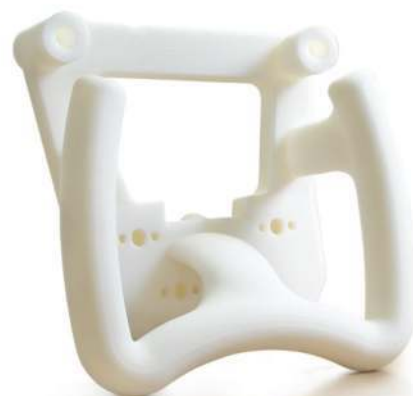
BMW's jigs and fixtures department used a Fortus® 3D Production System to manufacture assembly tools. This tool is used to affix the rear name badge.

3D printing also optimizes tool performance. Previously, designs for jigs and fixtures rarely improved past what was sufficient to do the job. Due to the expense and effort to redesign and remanufacture them, only malfunctioning tools