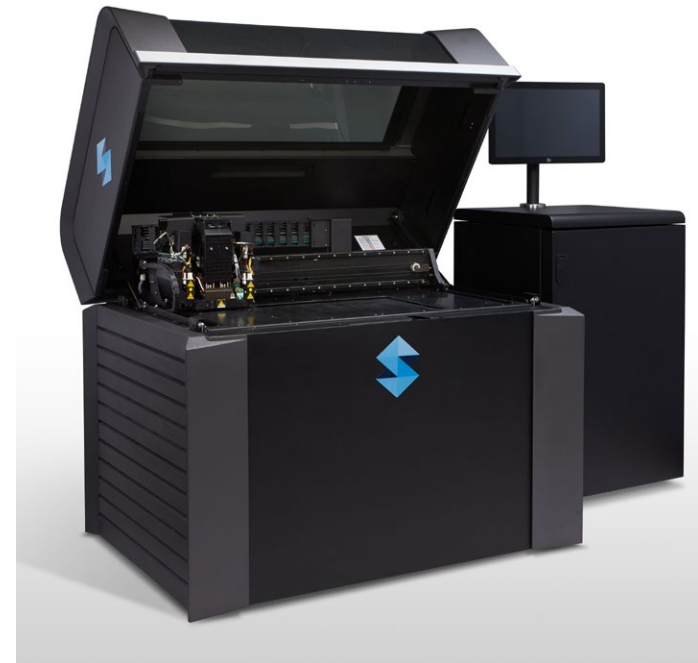
The Stratasys J850.

Then, contact Stratasys when it's time to start the conversation about how this technology can solve your educational challenges.