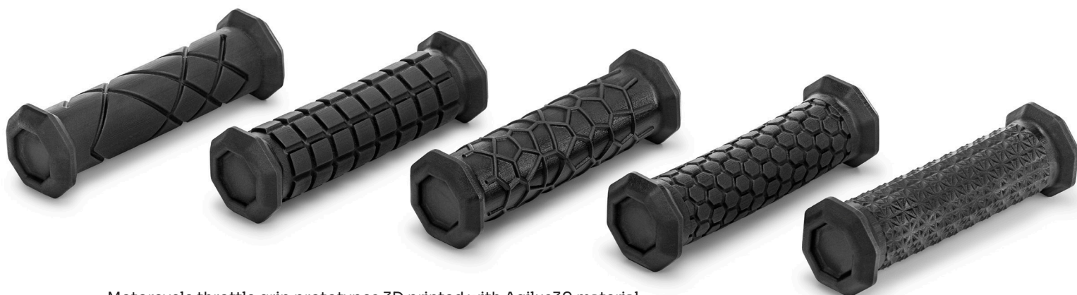
Motorcycle throttle grip prototypes 3D printed with Agilus30 material

With the J850 Pro, it's simple to create functional, multimaterial models that let you test and validate prototypes faster, and move through stakeholder review with ease. This leads to quicker decisions and approvals, helping you achieve product verification, increase throughput and save valuable time.