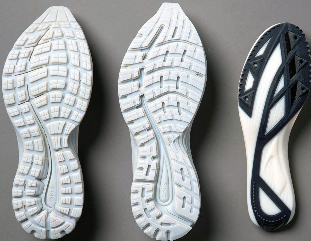
3D printed shoe midsole and outsole prototypes created by Brooks Running